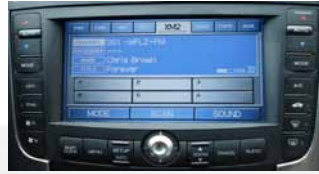
Factory Radio Not Included